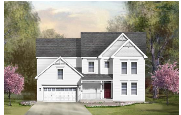
The Trumbull II A

Because we are constantly improving our product, we reserve the right to revise, change, and/or substitute product features, dimensions, specifications, architectural details and designs without notice. This brochure is for illustration purposes only and is not part of a legal contract. Prices are subject to change without notice. Room dimensions are approximate and calculated from inside the partition. Rev. 04/18