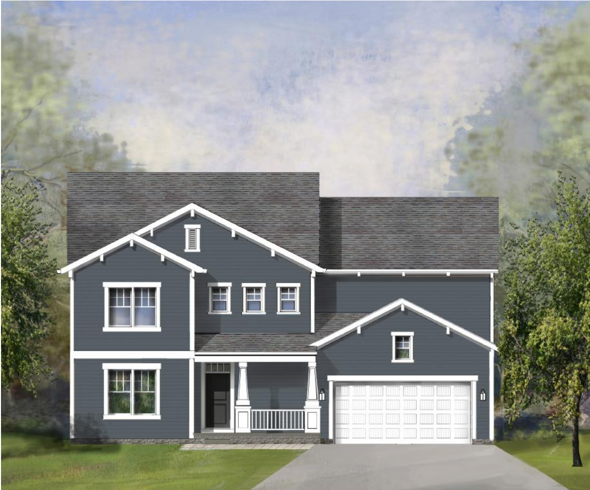
The Trumbull II B