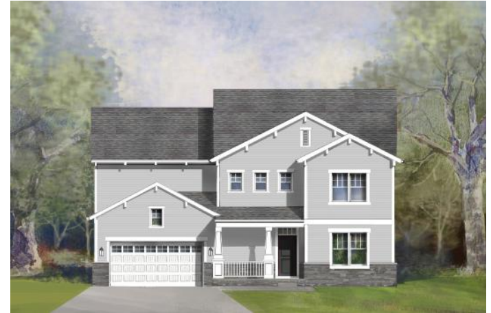
The Trumbull II B with optional stone