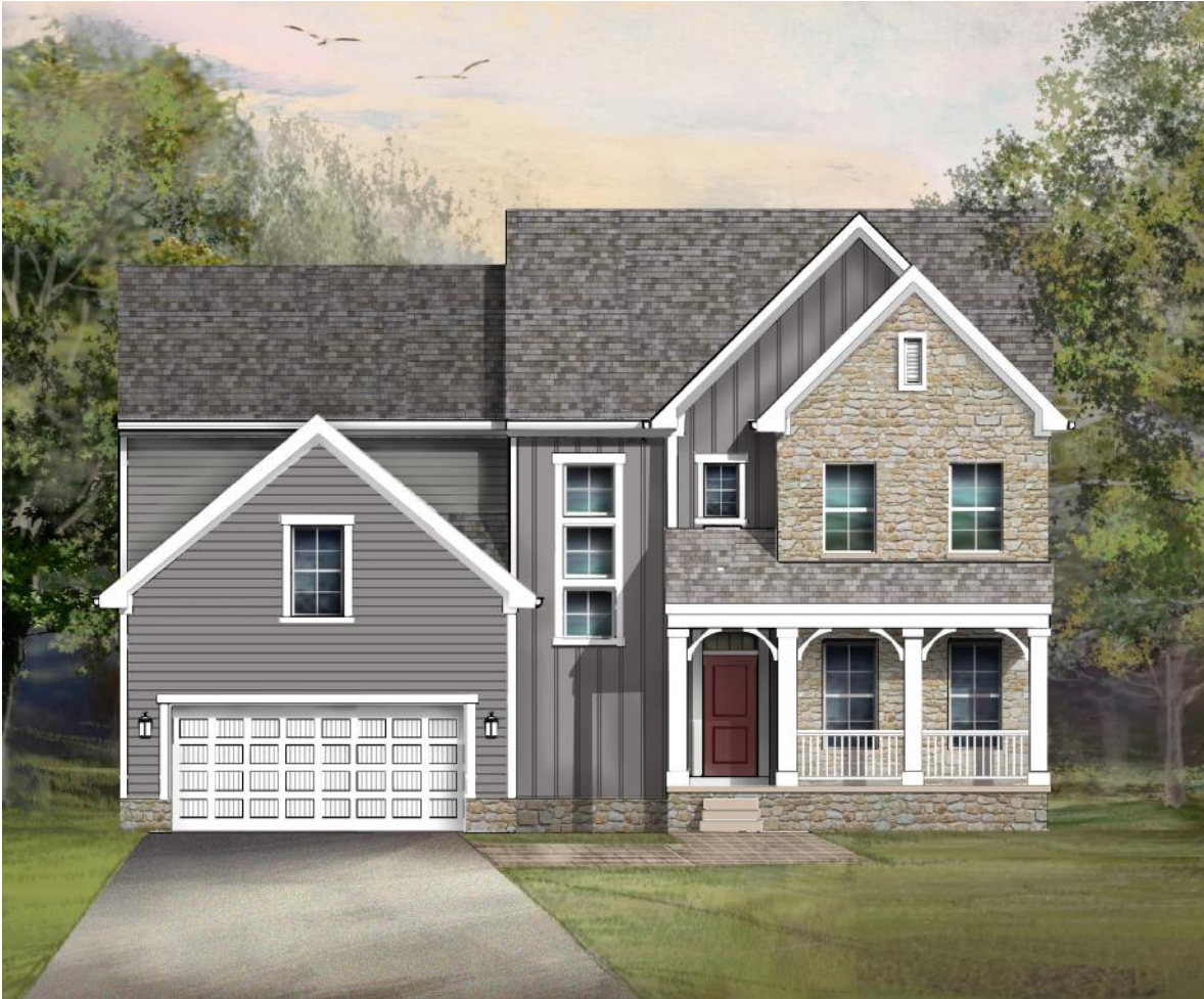
The Trumbull II C