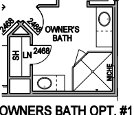
OWNERS BATH OPT. #1

Because we are constantly improving our product, we reserve the right to revise, change, and/or substitute product features, dimensions, specifications, architectural details and designs without notice. This brochure is for illustration purposes only and is not part of a legal contract. Prices are subject to change without notice. Room dimensions are approximate and calculated from inside the partition. Rev. 04/18