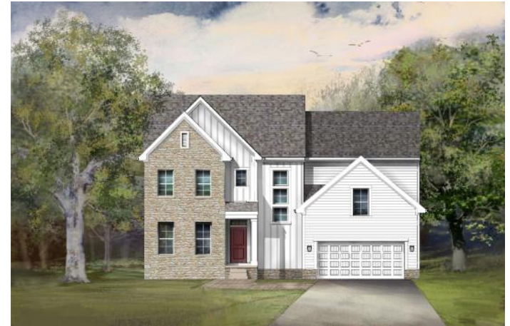
The Trumbull II B

Because we are constantly improving our product, we reserve the right to revise, change, and/or substitute product features, dimensions, specifications, architectural details and designs without notice. This brochure is for illustration purposes only and is not part of a legal contract. Prices are subject to change without notice. Room dimensions are approximate and calculated from inside the partition. Rev. 04/18