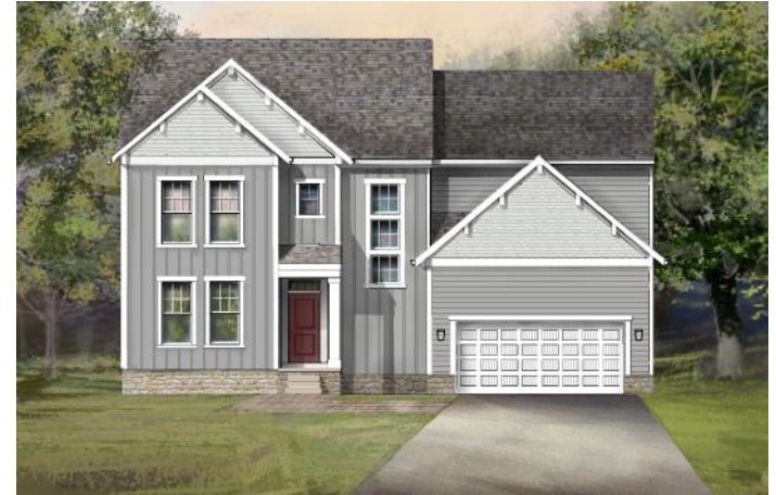
The Trumbull II A