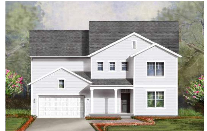
Trumbull II D

Because we are constantly improving our product, we reserve the right to revise, change, and/or substitute product features, dimensions, specifications, architectural details and designs without notice. This brochure is for illustration purposes only and is not part of a legal contract. Prices are subject to change without notice. Room dimensions are approximate and calculated from inside the partition. Rev. 10/18