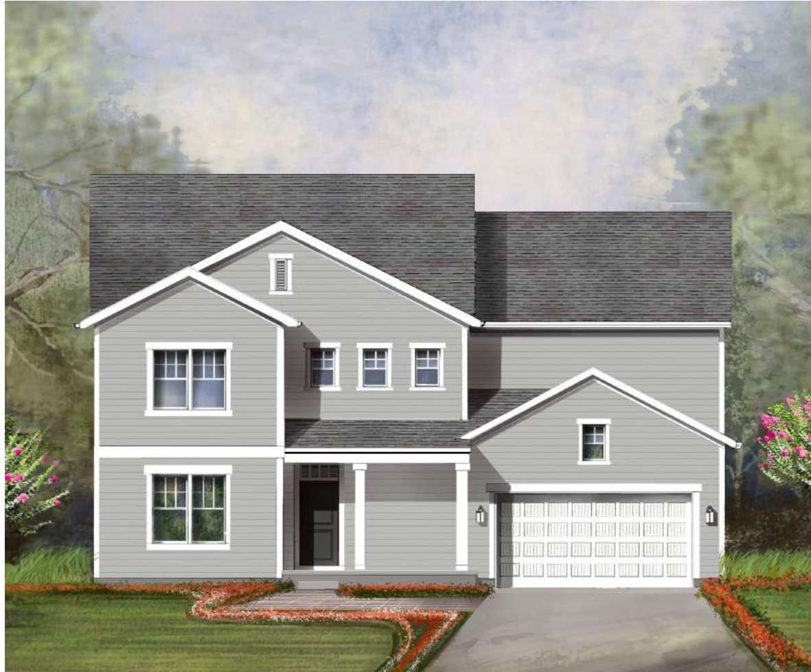
Trumbull II D