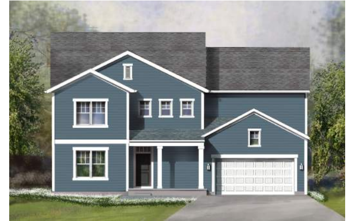
Trumbull II D