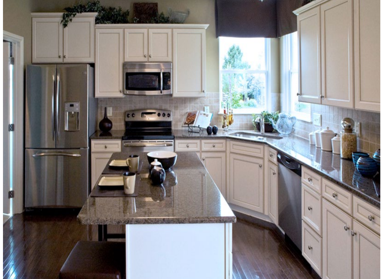
Large, functional kitchen