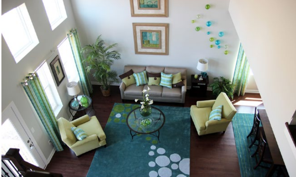
Personal designer to assist with your interior and exterior product and color selections