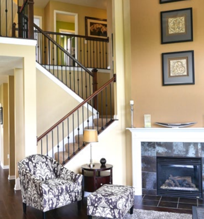
Spacious 9' first floor ceilings