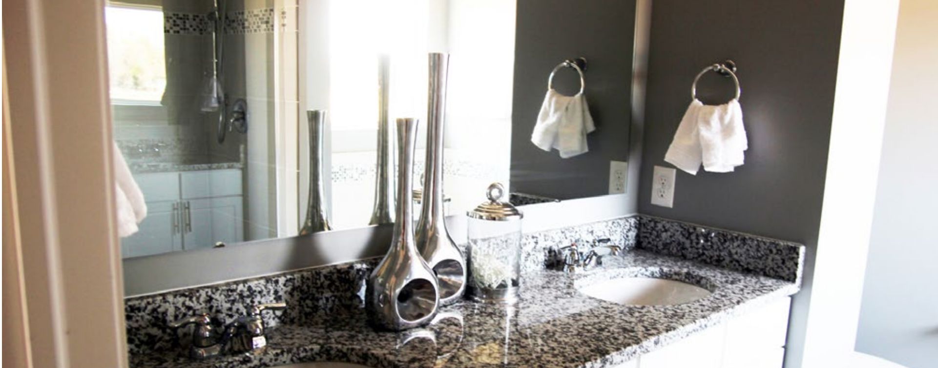
Custom bath options available