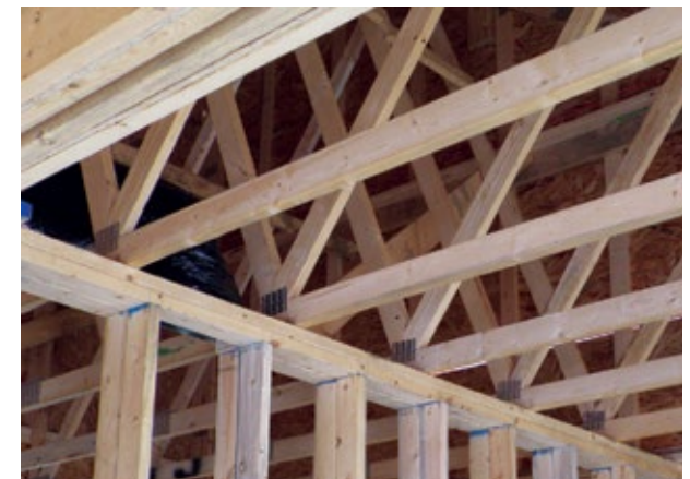
Support beams designed by Structural Engineer for increased support and durability