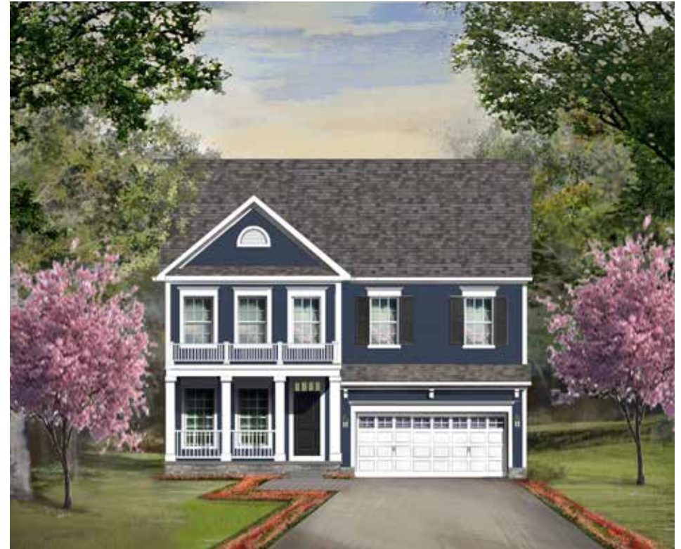
Madison II C

Because we are constantly improving our product, we reserve the right to revise, change, and/or substitute product features, dimensions, specifications, architectural details and designs without notice. This brochure is for illustration purposes only and is not part of a legal contract. Prices are subject to change without notice. Room dimensions are approximate and calculated from inside the partition. Rev. 3/17