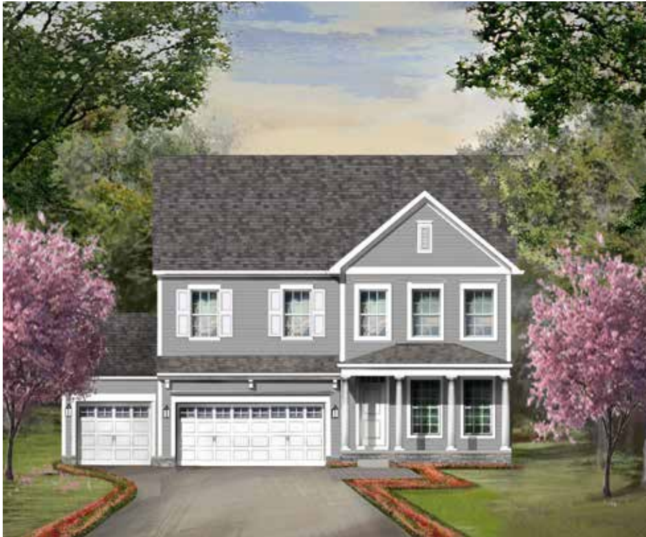
Madison II B